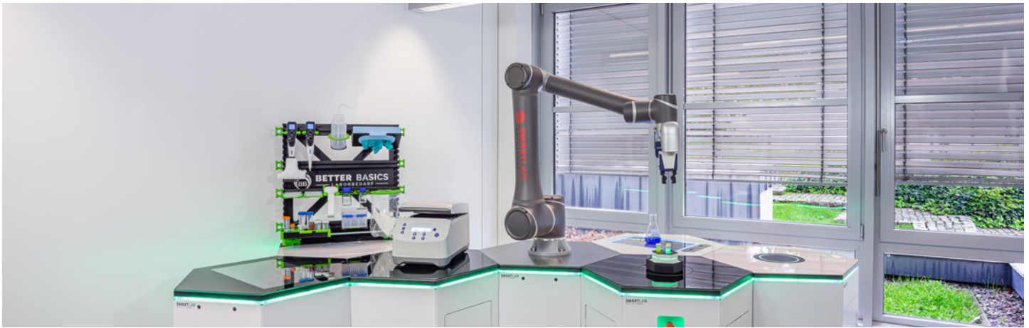
Modern laboratory environment: The SmartRack® together with digital and electronic laboratory equipment and work equipment