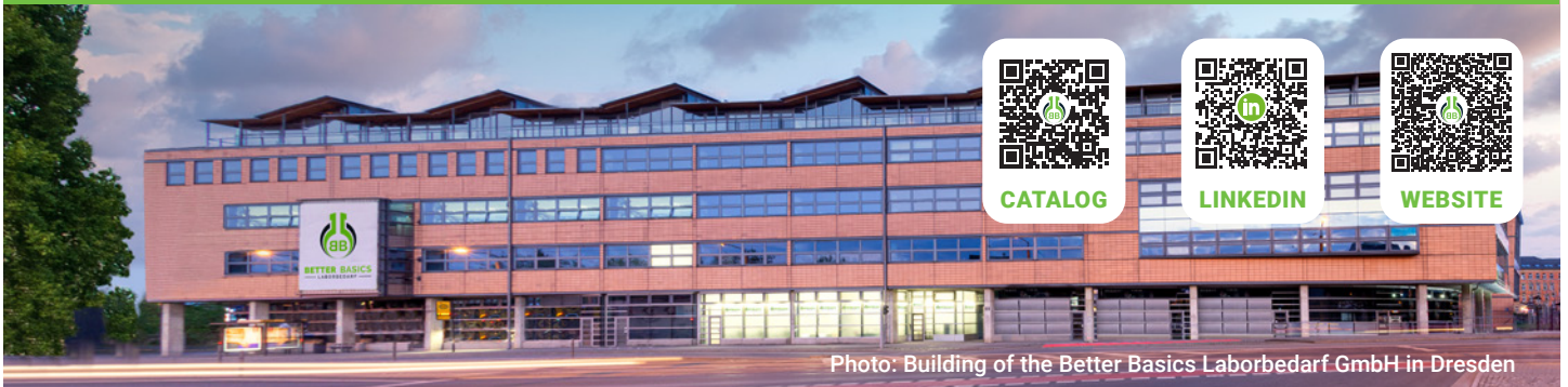
Photo: Building of the Better Basics Laborbedarf GmbH in Dresden